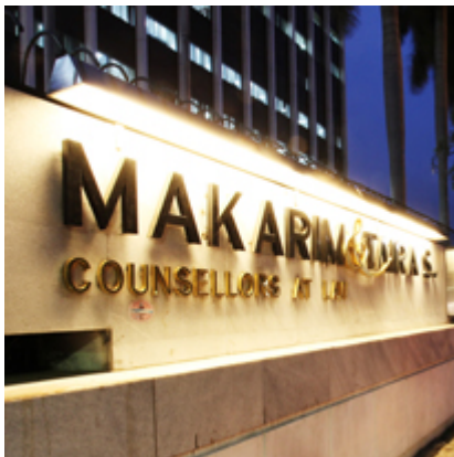
• M&T Updates

Please check their website: RDL ASIA-PACIFIC L&E LAW FORUM: Overseas Employment Compliance Management and Risk Control