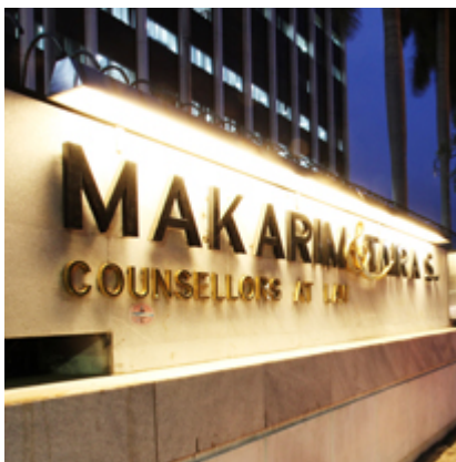
• M&T Updates